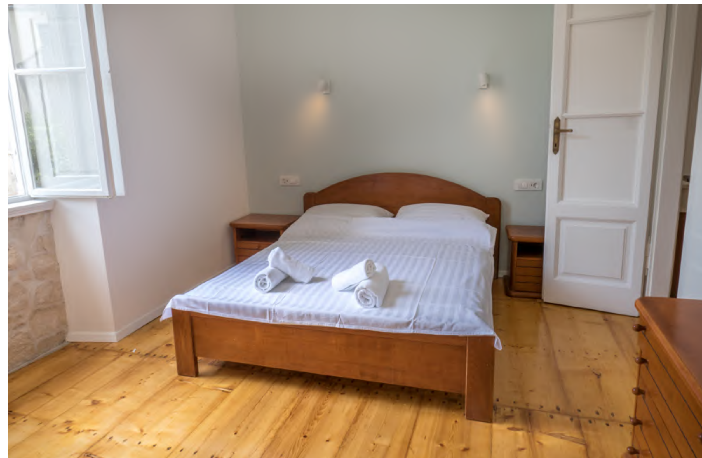
Second double bedroom with bed for two persons.