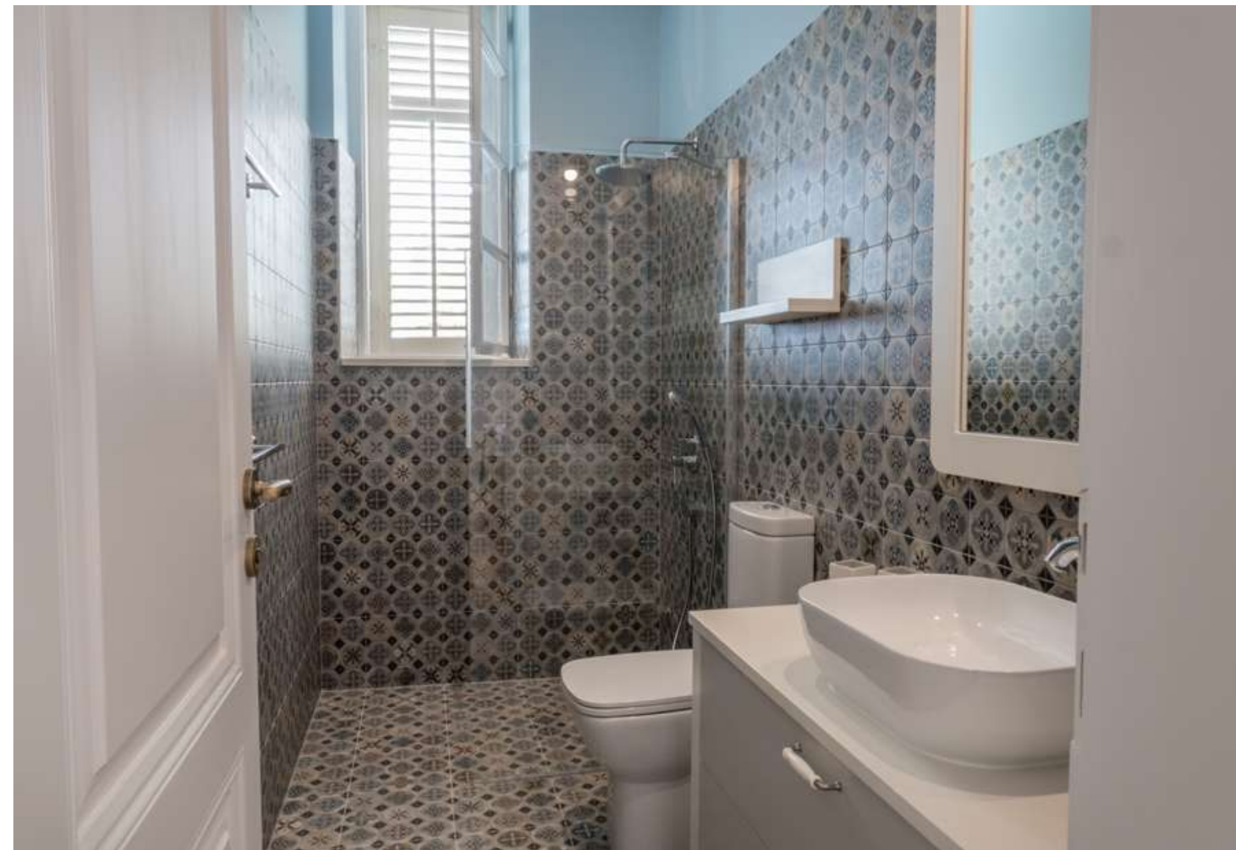
Second bathroom with shower.