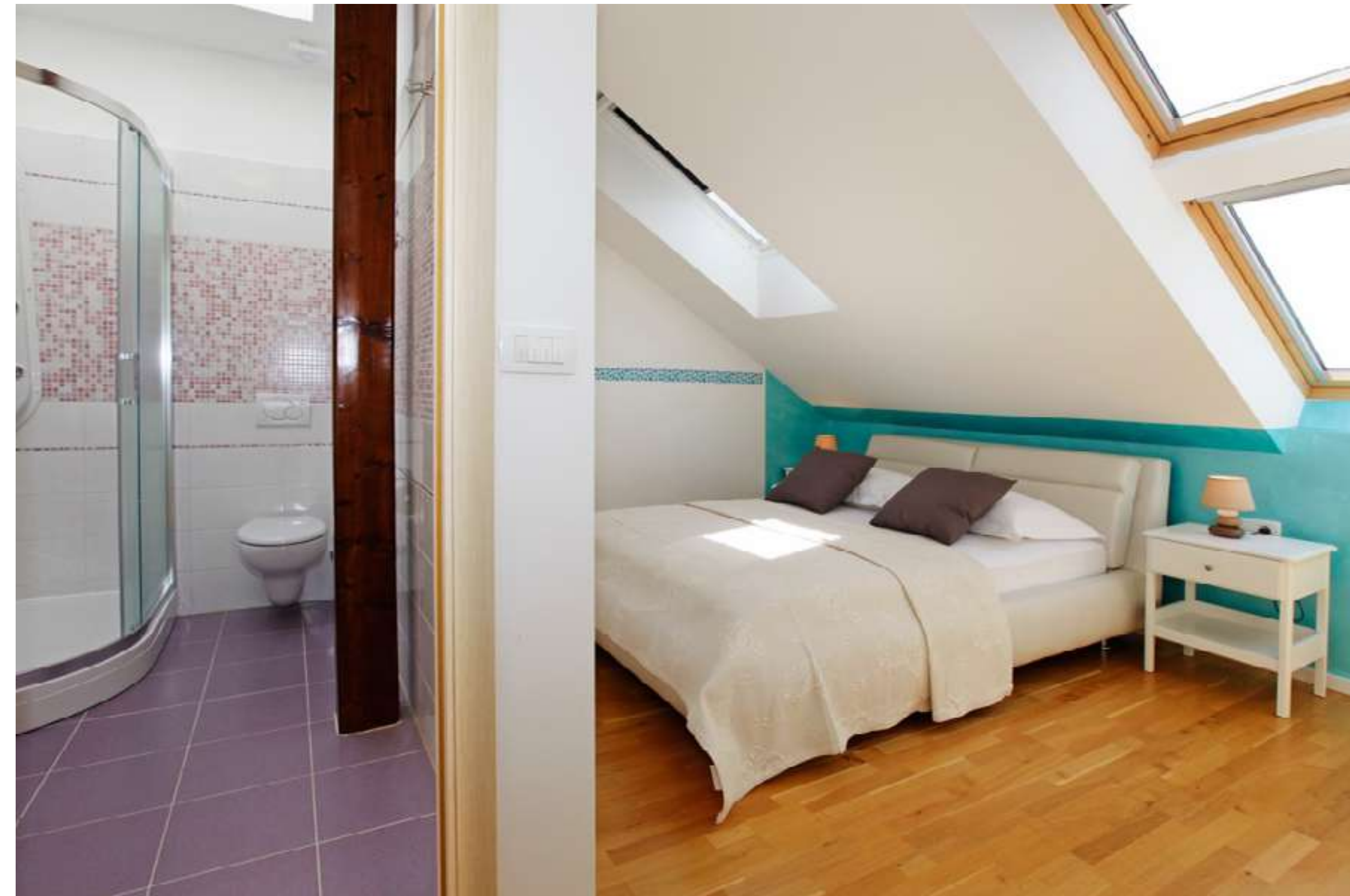
Wonderful master bedroom with double bed and en-suite bathroom