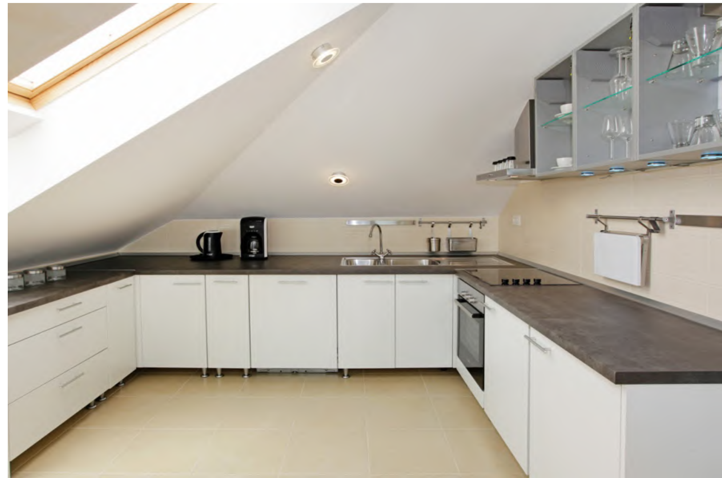
Right next to the dining area is fully equipped modern kitchen: cooker with an oven, refrigerator, coffee machine, dishwasher and kettle