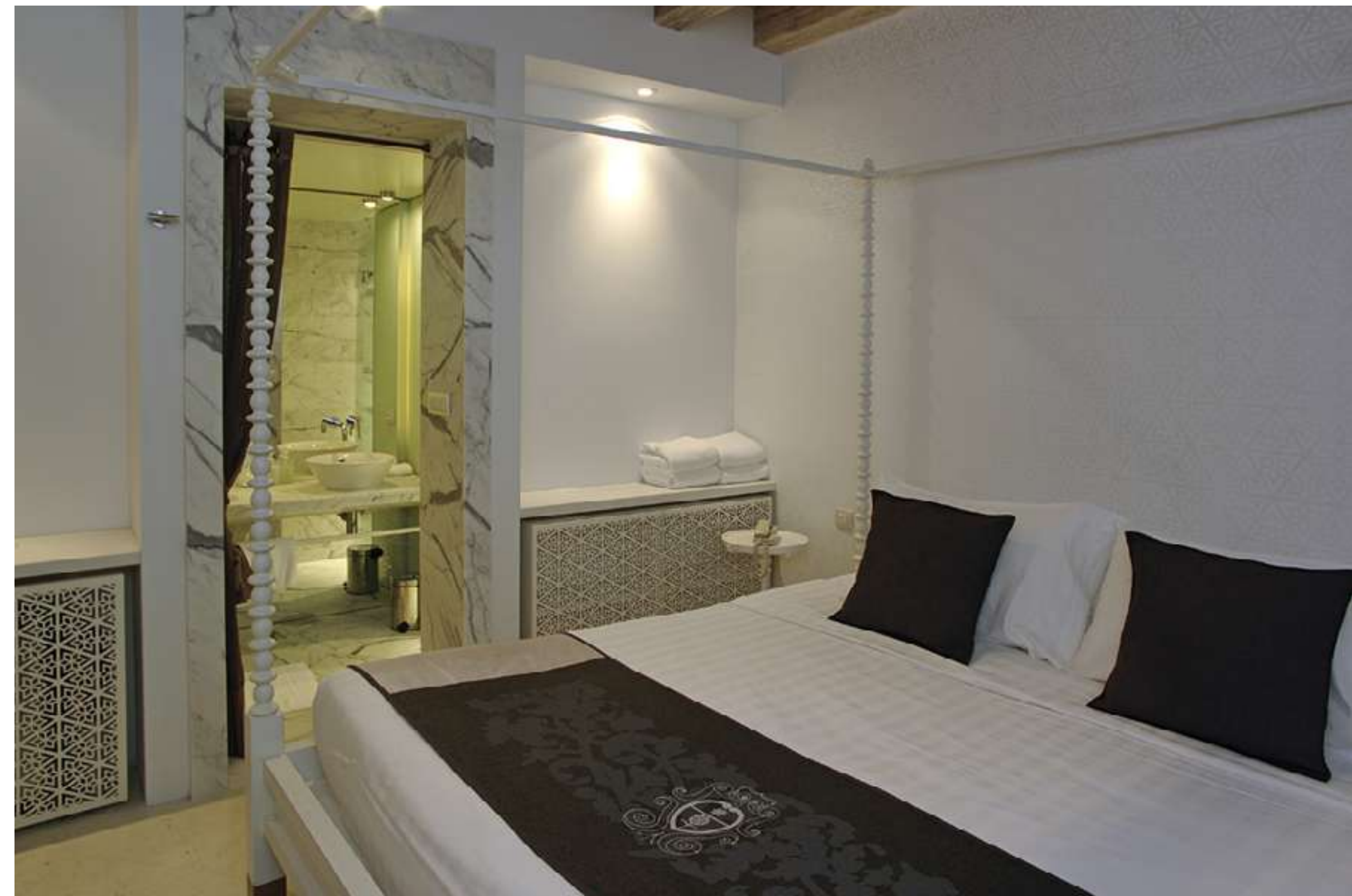
Next to the bedroom lies an en-suite bathroom