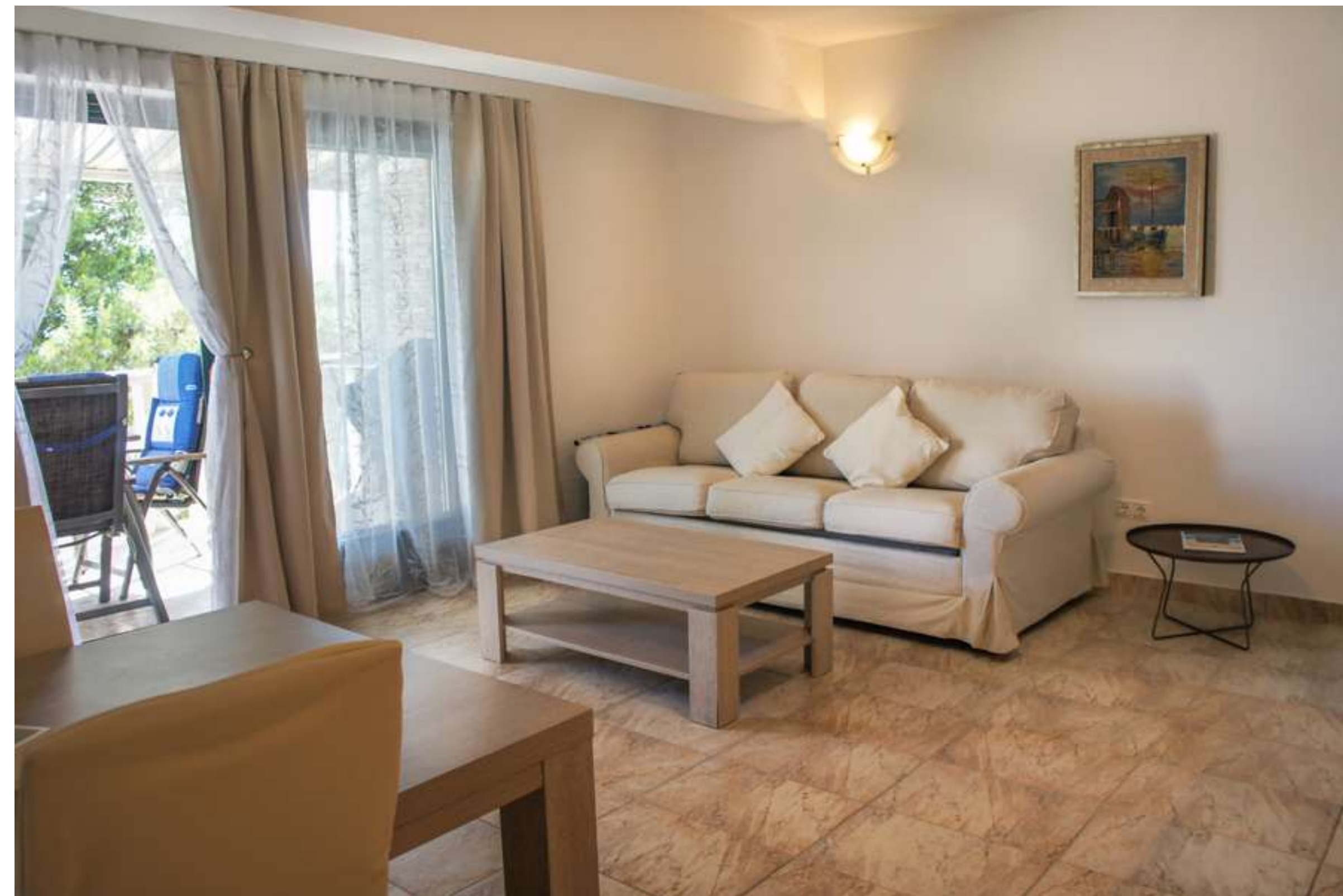
The living room features a cosy pull-out couch for 2 children