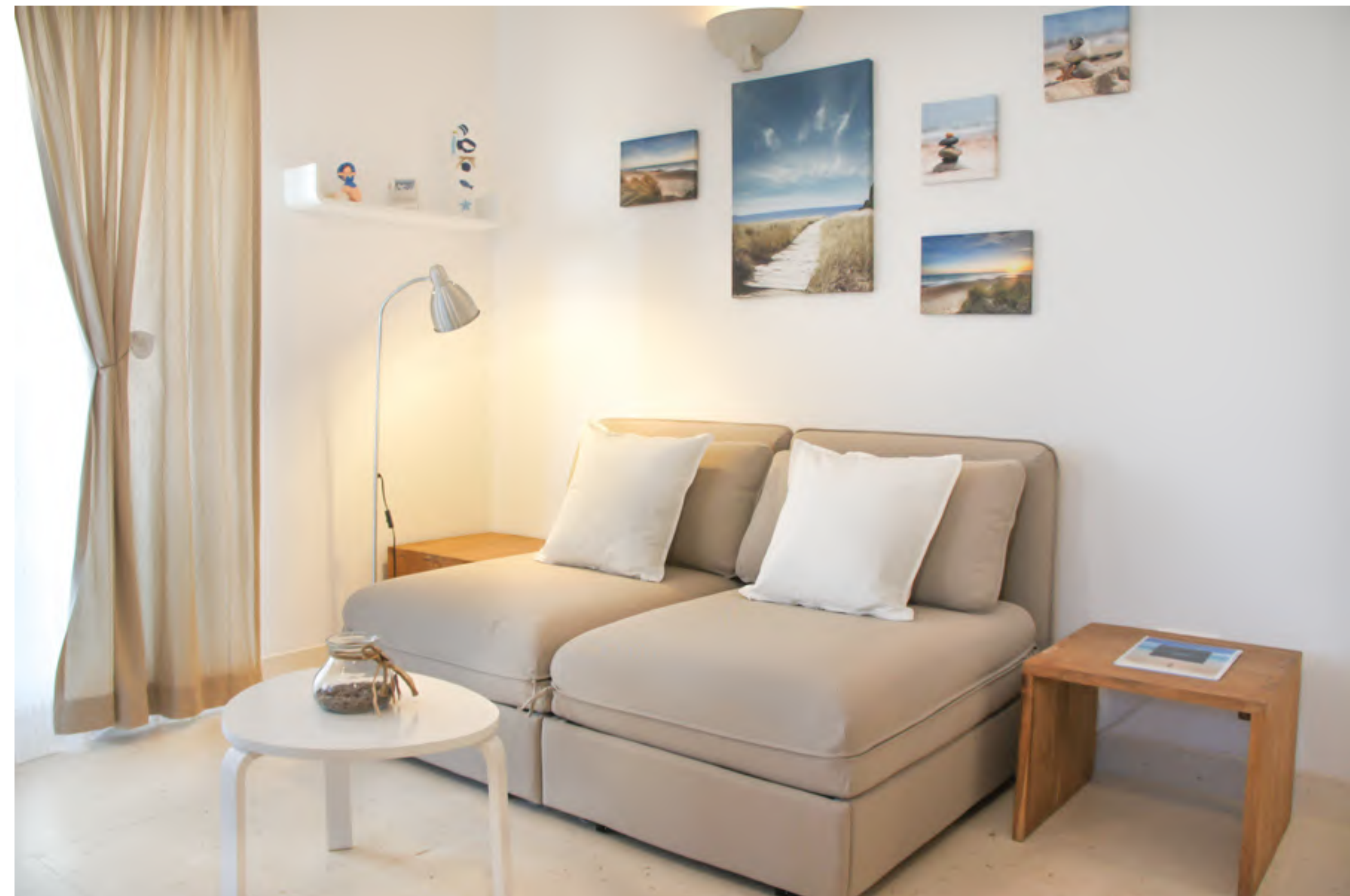
The living room features a cosy pull-out couch for 2 children